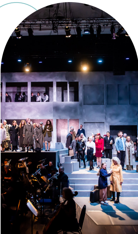
Great Hall: Blackheath Halls Opera Candide 2022